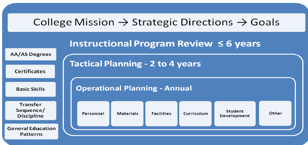
Figure 2: Conceptual design of program review and planning processes

At the operational level, smaller units of the college (departments or offices) will analyze their operations (personnel, materials, facilities, curriculum, student development, and other) in conjunction with the broader division or area in which they exist. The tactical level will analyze and evaluate the overall effectiveness of a broader division or area. Through program review, all functions of the college will be evaluated relative to the five instructional programs: AA/AS degrees, certificates, basic skills, transfer sequence or discipline, and general education patterns. Figure 2 provides a conceptual design of the program review and planning process.