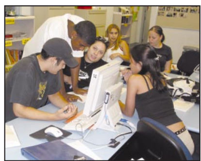
Working together in theTLC lab