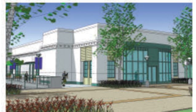
Artist's rendering of the Industrial Technologies Building.

All in all, the year 2009 will be a very important year in the overall development of Pasadena City College.