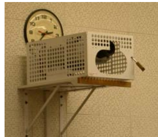
Wall mounted Cost $14800 (Not including tax and installation)