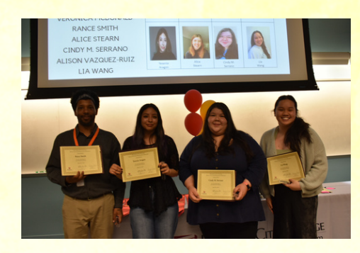
Some of the Poly interns being recognized at the Spring awards ceremony