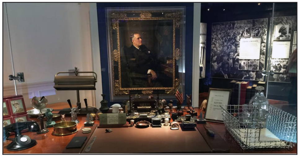
The photo above shows FDR's desk from the Oval Office and the items he always kept on it. Below is a photo of FDR's bedroom with a telephone which connected directly to the White House.

The Library deals with such subjects as the Great Depression, the New Deal, World War II, the Japanese internment and Roosevelt's memorable speeches. One can also see famous memorabilia, such as FDR's wheel chair and the car he drove (with manual controls) on the house grounds.