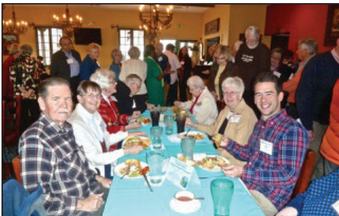
A good time to meet up with friends is at one of the many food events. Luncheons always get a good turnout of Virtual Village members.