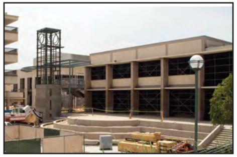
Work on the buildings is down to the finishing touhes.

The construction dust will barely be settled when the next phase of the Measure P projects begins. Construction on the Center for the Arts is scheduled to begin in the late Fall.