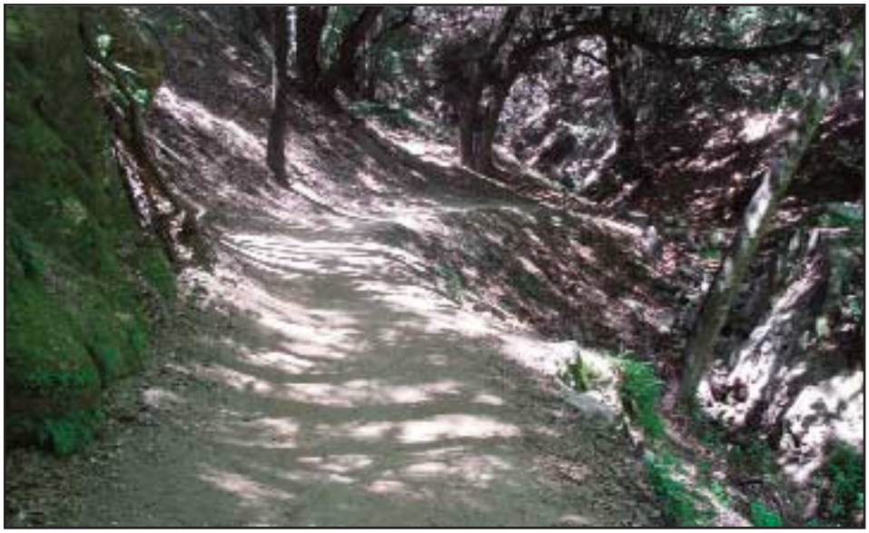
In case you think I tend to exaggerate, take a look at the shot of the trail we had to take to make the nice, easy walk to Bruce's cabin.