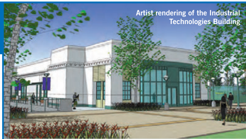
Artist rendering of the Industrial Technologies Building