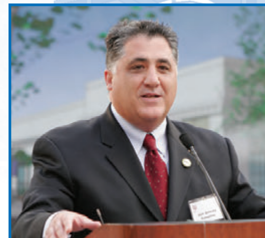
Assemblymember Anthony Portantino

Through the communication of requirements by the faculty and staff to the architects, the new building will serve PCC's instructional needs in a way that has been impossible up to this point.